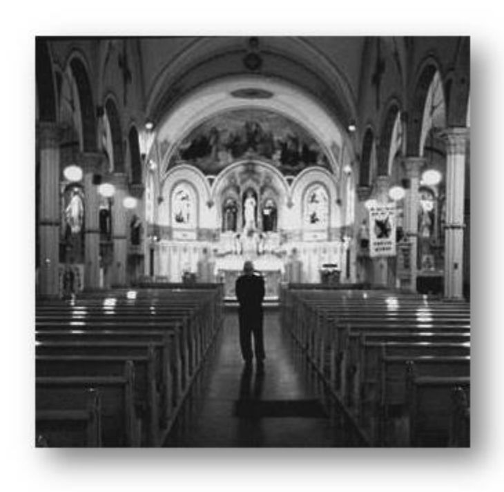
THE EMPTY VESTIBULE

word of love to me ... Who has fed you with the Bread of Angels, and Who ever beholds you ... and sustains you in my love. I am puzzled, my child; but more than puzzled, I am greatly sorrowed.