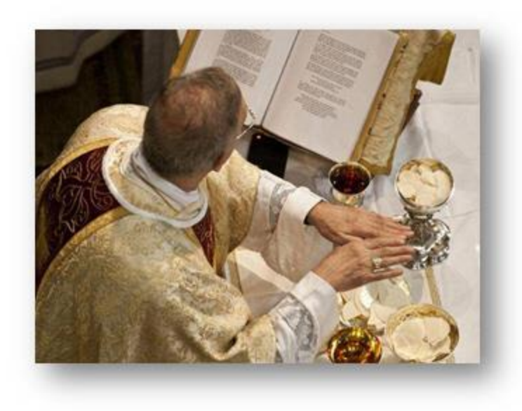
and after he does this, they become