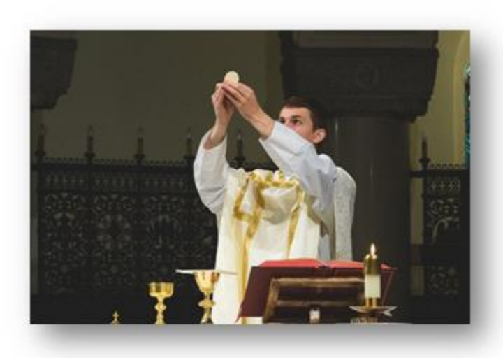
The priest offers the Holy Eucharist up to God

but now it is really the BODY and the BLOOD of Jesus Who gives Himself to us in HOLY COMMUNION .