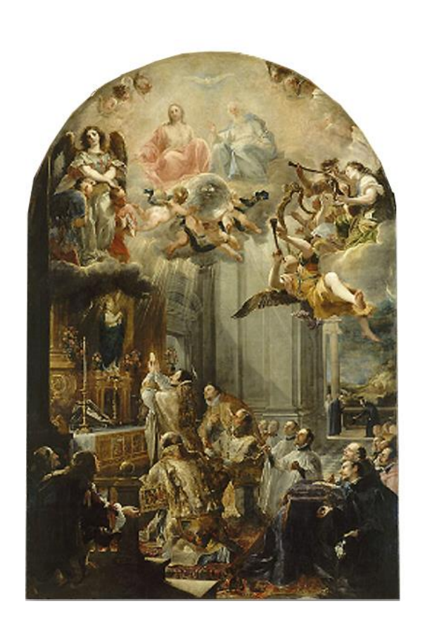
The Most Holy Sacrifice of the Mass

You have just received Jesus on your tongue, and He goes into your body and soul and you become filled with Grace and become very pleasing to God! Angels gather all around you (although you will not see them — but they are there!) — right beside you, singing praise to God for the most beautiful gift He just gave you: Himself!