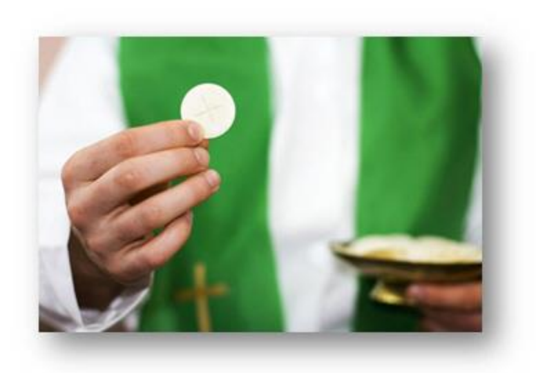
Here the priest is offering to you the Holy Eucharist, the Body of Jesus at Mass

And when you go to receive Holy Communion, the priest first says to you: