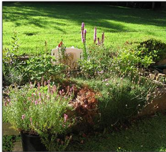
• A Simple Mary Garden