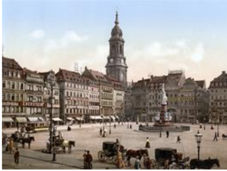
Dresden at the turn of the century

Dresden as another Paradigm of the aftermath of Vatican II