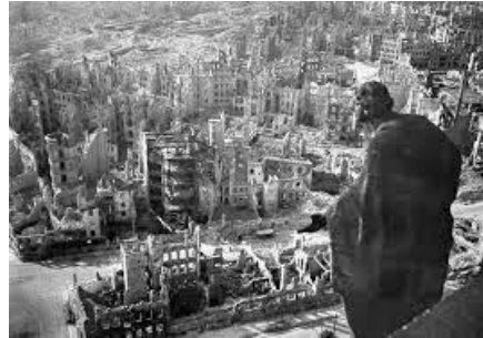
Dresden less than 50 years later in 1945

Dresden as another Paradigm of the aftermath of Vatican II